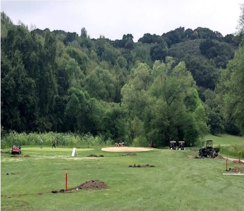
1 st hole Installation During COVID-19 Closure